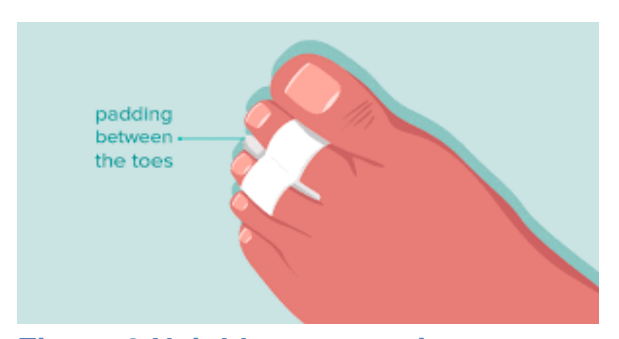
Figure 2 Neighbour strapping

The above strapping is applied for comfort/support only and not as treatment of the fracture/break.