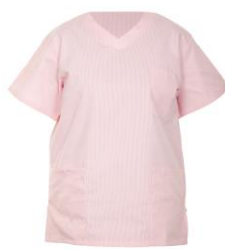
Domestic Pink and white candy stripe scrub top