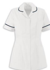
Physiotherapist White with navy trim