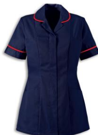
Matron Navy with red trim