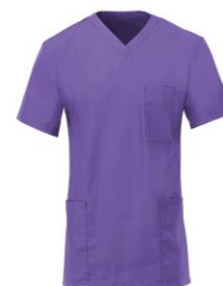
Paediatric Advanced Nurse Practitioner Purple Scrub Top