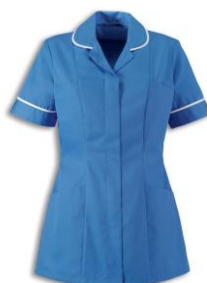
Health Care Assistant Hospital blue with white trim