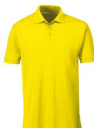
Play Specialist Yellow polo shirt