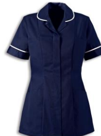
Ward Manager/Deputy Navy with white trim