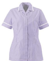
Housekeeper Lilac stripe with white trim