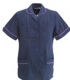
Specialist Nurse Navy with purple trim