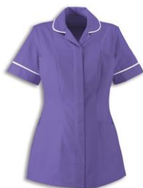
Head of Nursing Purple with white trim

Many people are involved in caring for you while you are in hospital and the majority will wear a uniform and a name badge. Staff will introduce themselves but if you are in doubt about who they are, please ask.