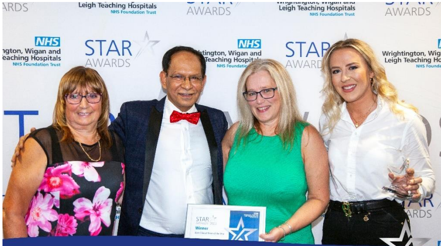
Non-Clinical Team of the Year Award Mortuary Team