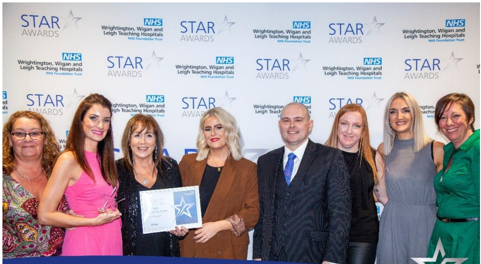
Clinical Team of the Year Award Critical Care Outreach