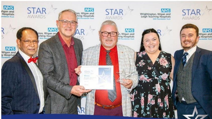
Non-Clinical Team of the Year (Corporate/Support) Award Catering Team