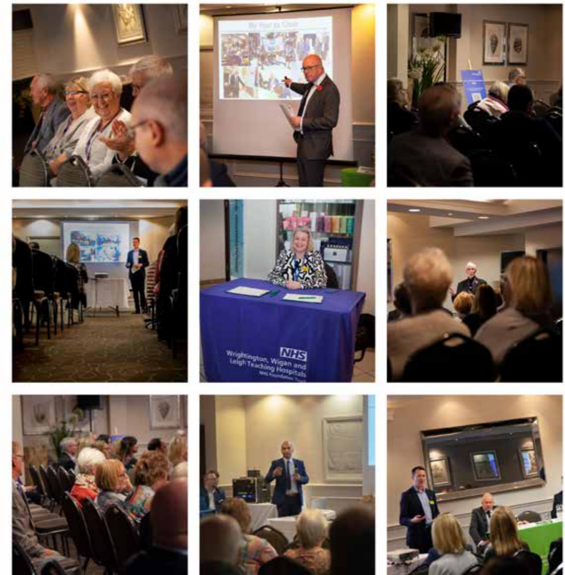
Pictures from our most recent Annual Members' Meeting