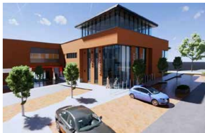
Artist's impression of Aspull Health and Wellbeing Centre

Aspull Health and Wellbeing Centre is the result of a multi-million-pound project between WWL, Aspull Surgery, and OneMedical Property, with support from NHS Greater Manchester Integrated Care Board and Wigan Council.