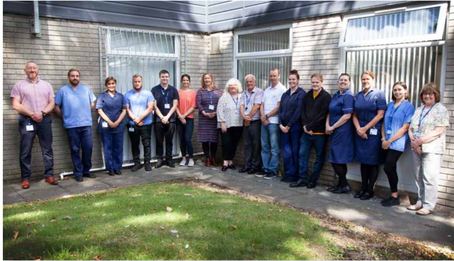
WWL's Research Team with other WWL team members at the Research Hub in Ashton-in-Makerfield

A previously unused health clinic has been transformed into a bespoke and accessible clinical research hub based in the community of Ashton-in-Makerfield.