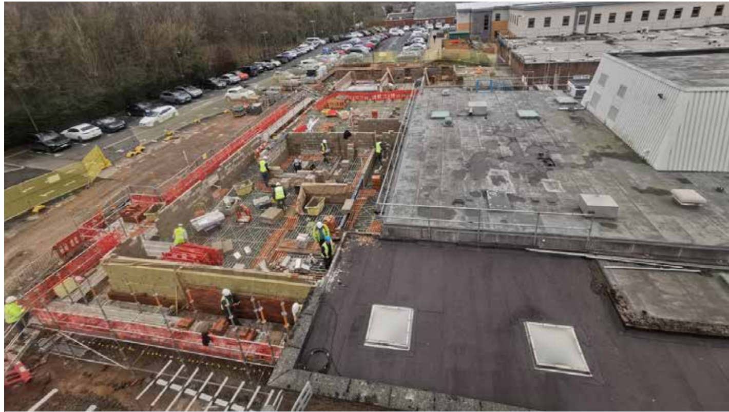
Work taking place on the new Community Diagnostic Centre, Leigh Infirmary

Work is continuing at pace on the fantastic new Community Diagnostic Centre (CDC) and Theatre Development at our Leigh site.