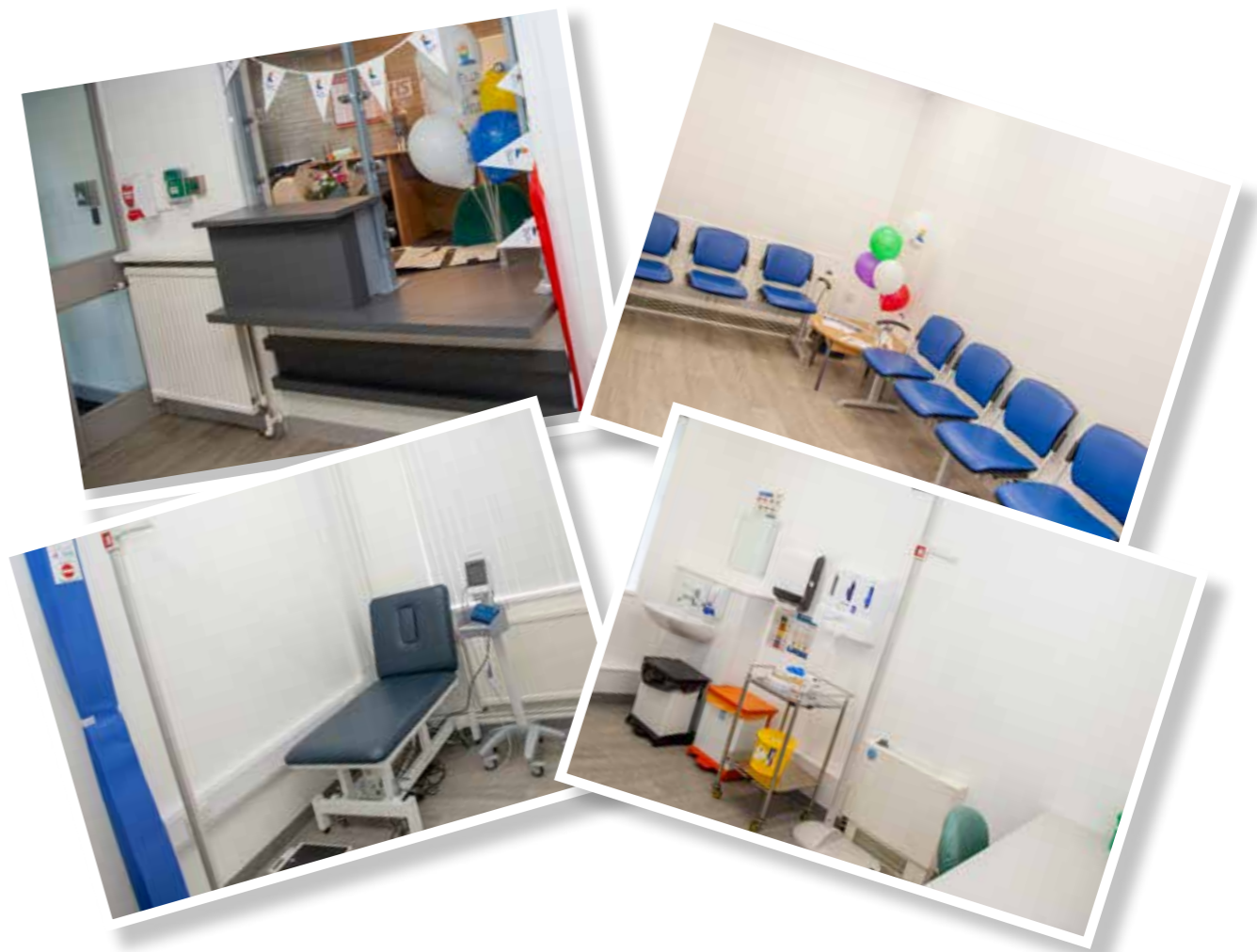
Internal shots of the new Research Hub

The Trust was also able to purchase new and essential clinical research equipment for the new facility, thanks to a grant provided by The Greater Manchester Clinical Research Network (GMCNR).