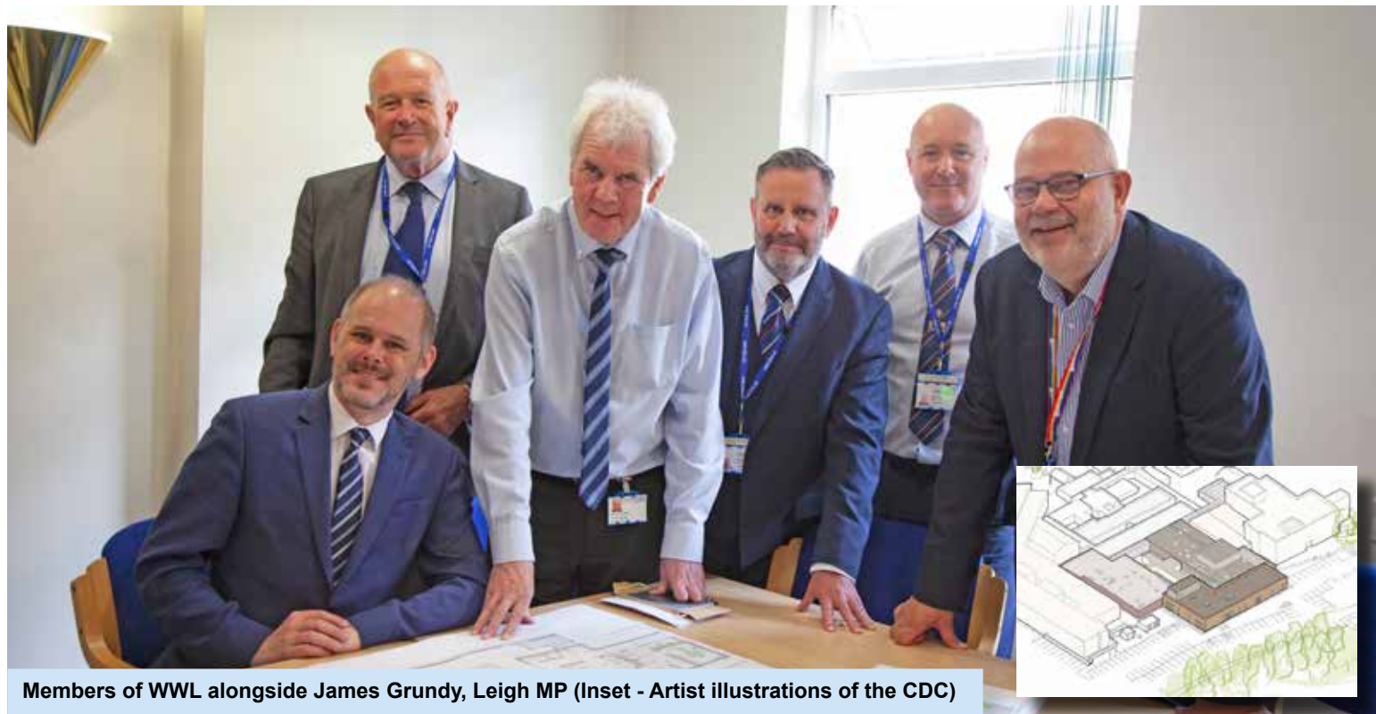
Members of WWL alongside James Grundy, Leigh MP (Inset - Artist illustrations of the CDC)