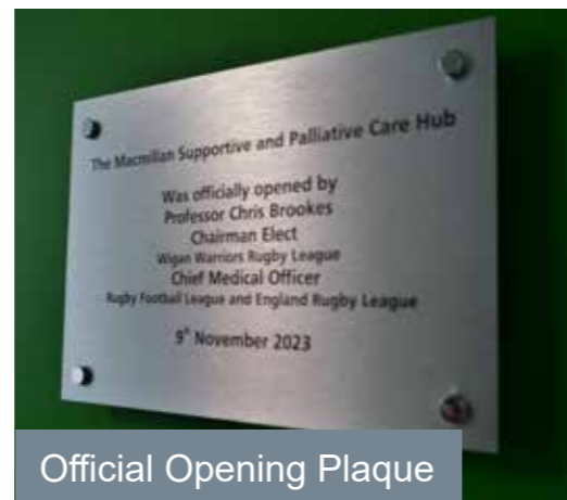
Official Opening Plaque

Read more about the official opening here .