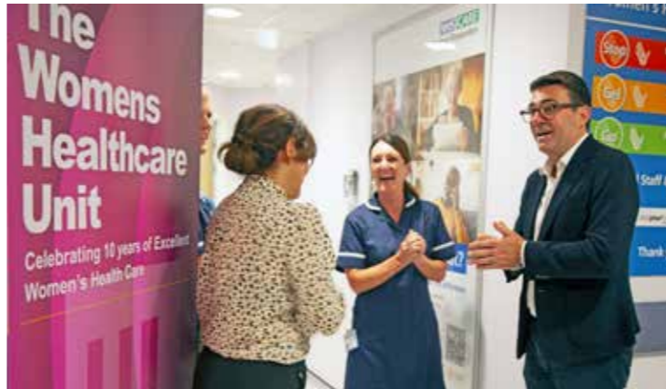
Mr Burnham meets WWL Women's Healthcare Unit staff

The building was officially opened in January 2014 by Mr Burnham during his time as MP for Leigh and the then Shadow Secretary of State for Health.