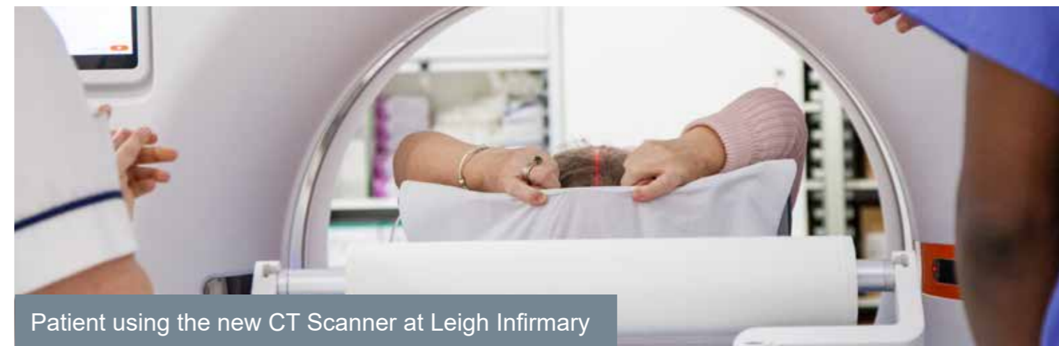
Patient using the new CT Scanner at Leigh Infirmary

You can read about the experience of the first patients to use the new department back in November here .