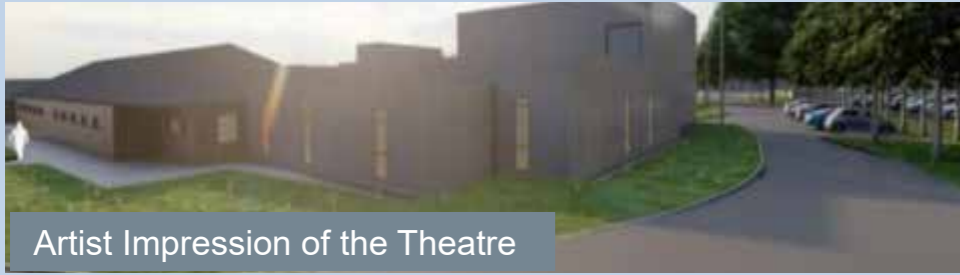
Artist Impression of the Theatre

Construction work has begun at Wrightington Hospital after planning approval was received to build a new laminar flow theatre on the site.