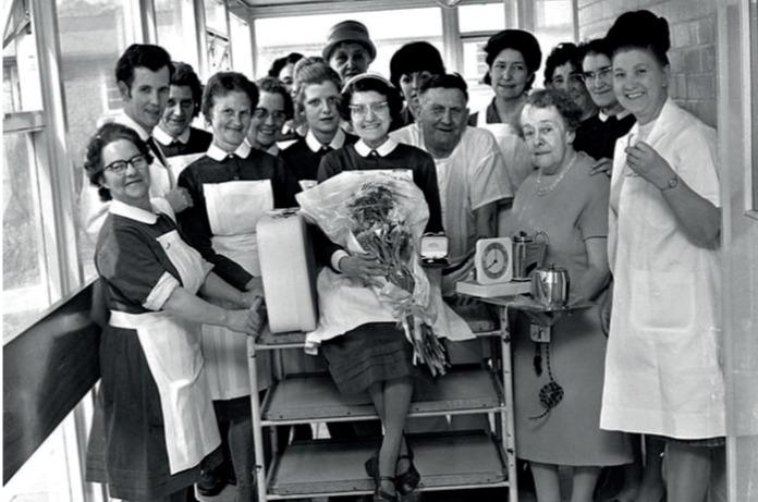
Nursing colleague retirement at Wigan Infirmary