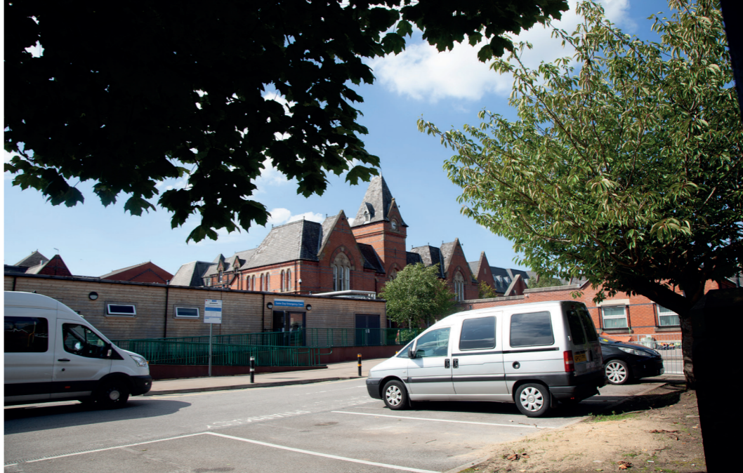
RAEI in the present day

And through me each one of them says ‘thankyou’. Thank you, Wigan Infirmary, for the work you do, for the support and comfort you give. Thank you for rising to the many challenges over the last 150 years and for the work you, and those who follow, will do in the coming years. Thank you for being the sticky toffee lolly we will continue to hold on to, because you are truly good.