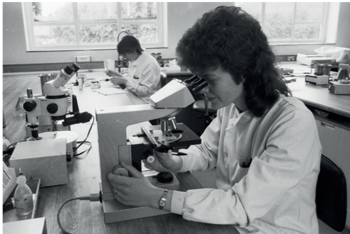
Wigan Infirmary Pathology Department in 1987

still living in cramped dwellings with no running water. Ironically, a previous Trust headquarters in Standishgate was built on what had once been one of the worst back-to-back slum areas in the town.