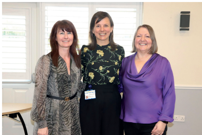
WWL's Three Quality Champion Platinum Badge Holders

Everybody across the Trust is welcome to become a Quality Champion, including our volunteers and short-term work placements as we welcome many different and diverse views from across the organisation.