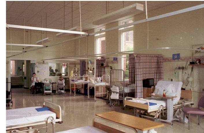
Wigan Infirmary's Gidlow Ward in 1998

We would never expect anything less from the Trust's loyal workforce – in this generation or previously. For 150 years, the RAEI has been the anchor in many storms of life. Whether you're a distressed child, crusty grandads, pit or motorway accident victim, going through the darkest of times or rejoicing in new life, Wigan Infirmary has been there.