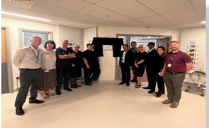
Official Opening of the ECU

"The staff who work on this unit are passionate about providing the best level of care for patients at Wrightington and they should be proud of what has been achieved here."