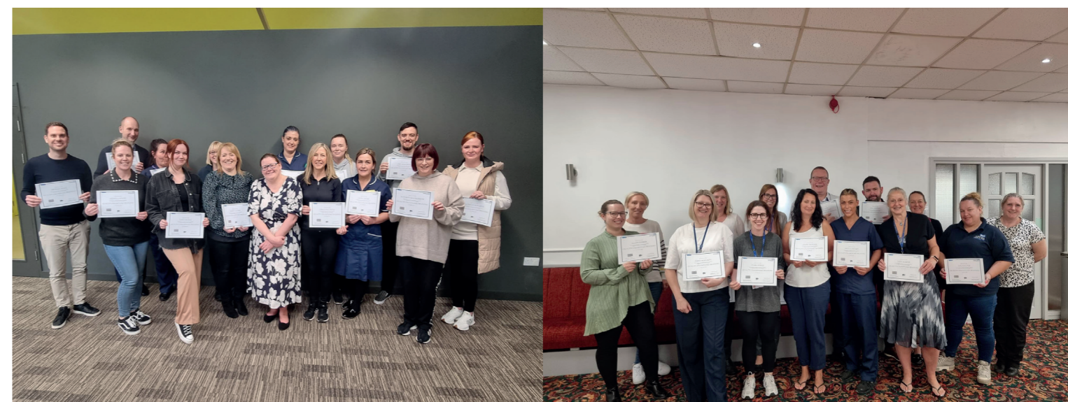
Cohorts 30 and 31 of Quality Champions who recently completed the Programme

compatible pacemakers that was also shared with Salford Royal NHS Foundation Trust. This means that patients can be seen at our sites rather than having to travel to a regional hub, meaning less delays and less stress. • The 'Fantasy Feelgood' work/life balance wellbeing awareness project within IT services. This project which supports wellbeing awareness and positivity throughout the service has spread further to NHS South, Central and West Commissioning Support Unit to support NHS staff.