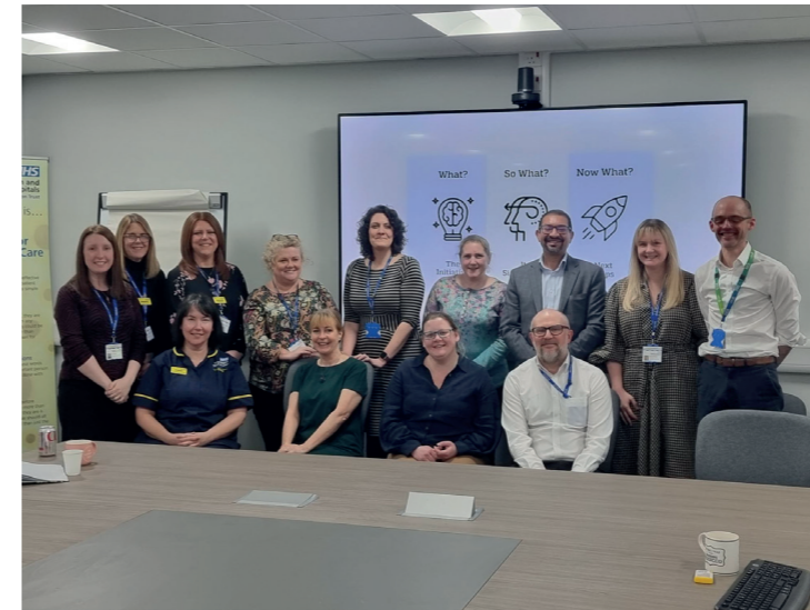
The Continuous Improvement Team with wider WWL colleagues focussing on streamlining improvement initiatives

And Gold badges were awarded to pioneering projects including: