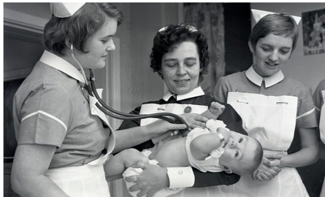
The intensive care unit reopening at Wigan Infirmary in 1969

Today, we don't need a toffee lolly to recognise the visual aids we pass, and perhaps visit, almost every day - the noble buildings which the generosity of our fellow townsfolk first started to create in Wigan 150 years ago.