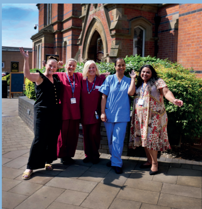
WWL Colleagues who visited Westminster Abbey

national celebrations and I can't think of a better group to proudly represent everyone at WWL, it looked like they had a fantastic time."