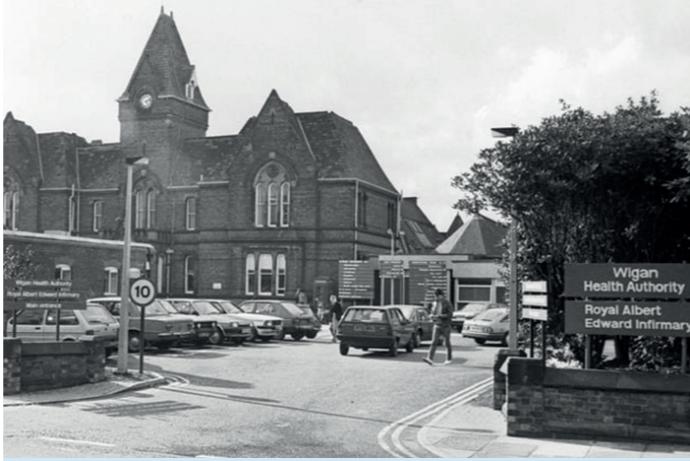
Wigan Infirmary entrance in the 1980's

Diseases, such as pulmonary tuberculosis (often called consumption) were endemic, others such as cholera, were frighteningly epidemic. In the morbidity statistics, infectious and respiratory causes predominated.