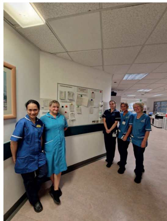
The Acute Stroke Unit (ASU) Team with their MyQ Board

Each year, we hold special celebration events where Silver and Gold badges are awarded to colleagues who have made a significant difference in delivering real improvements across the Trust for both patients and staff.