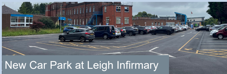
New Car Park at Leigh Infirmary

"This has made a huge difference for patients accessing our services at the Leigh site and takes away the stress of having to find a parking space. I would like to thank all my colleagues who have been involved in the upgrade and look forward to seeing how we progress with our car parking strategy across the Trust."