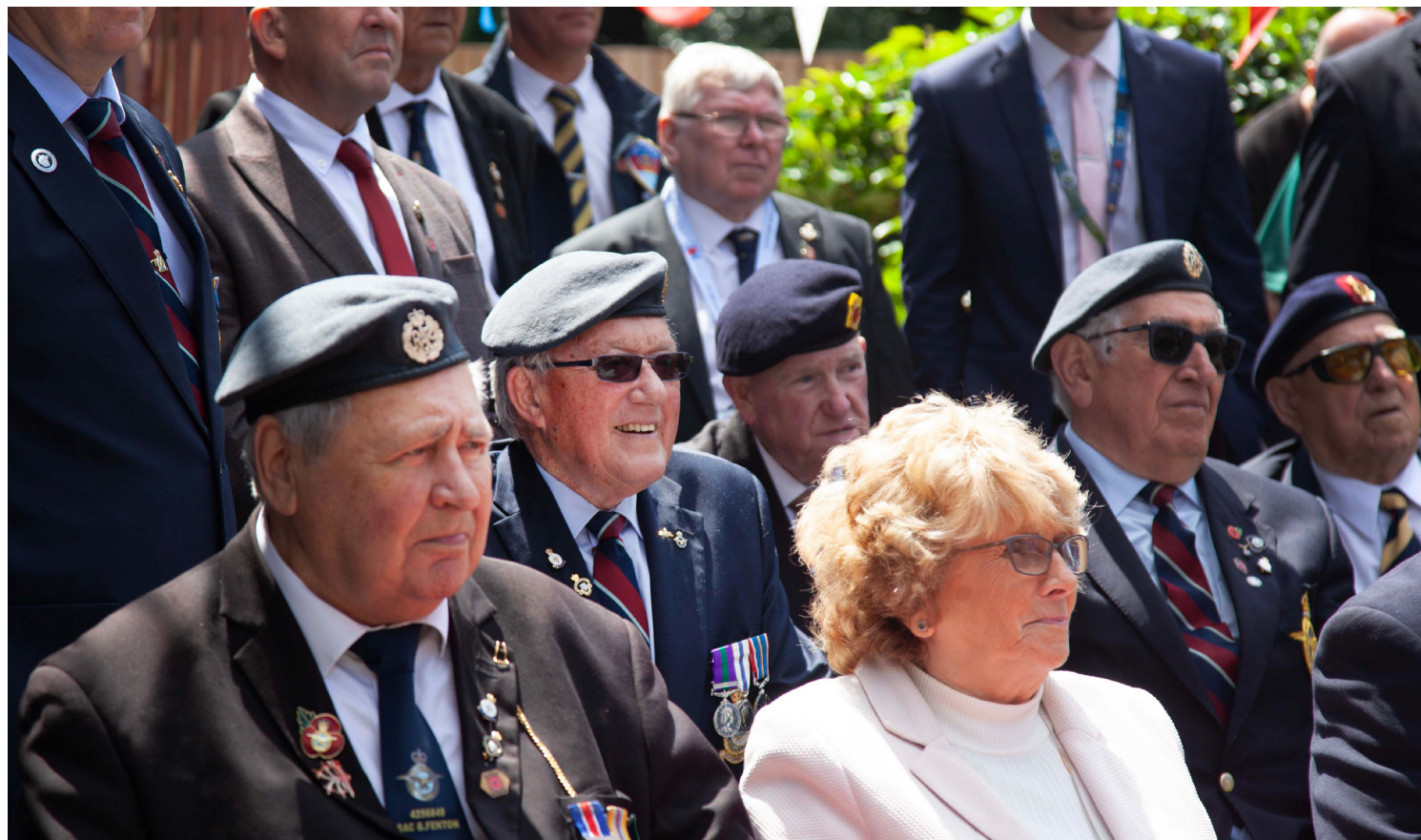
Veterans at the Official Opening of New Veteran's Garden

"We just ask that people respect that it is a place of reflection and space for some of our Armed Forces Community and treat the garden as such."