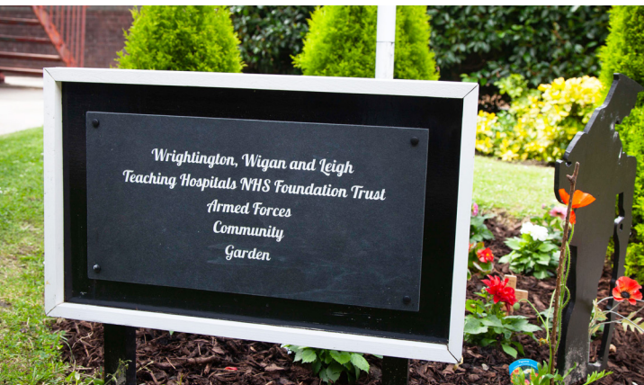
Armed Forces Community Garden Plaque