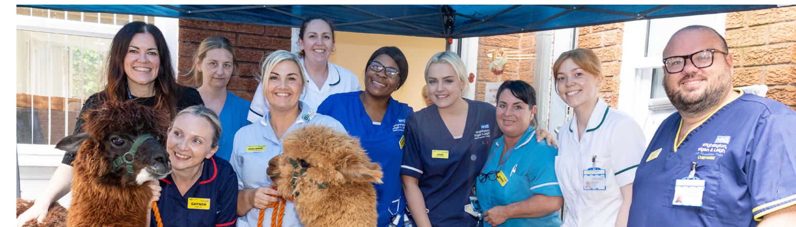
Alpacas visiting Jean Heyes Reablement Unit