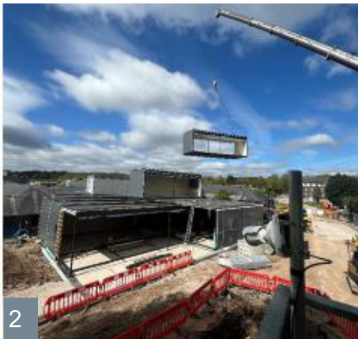
2 - Modular unit are lifted into place at Wrightington Hospital