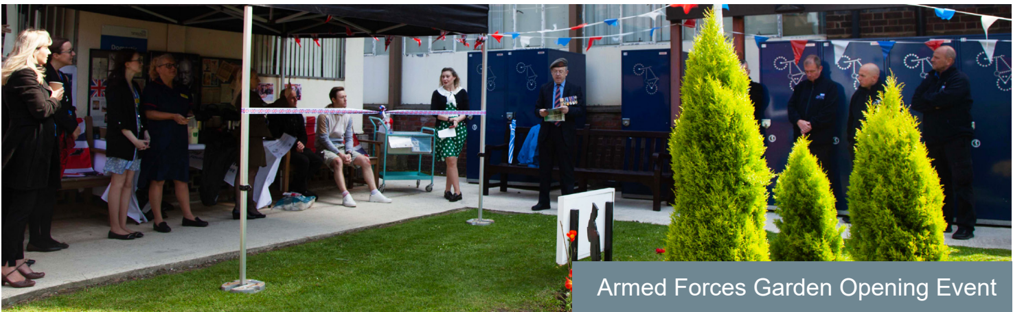
Armed Forces Garden Opening Event