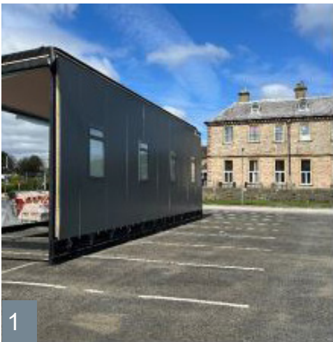
1 - Modular unit for Theatre 11 at Wrightington Hospital

Finally, at the Royal Albert Edward Infirmary, our four-storey build to house new Endoscopy Services at our Wigan site continues, with another major step in its development, as contractors completed a 13 hour concrete pour, setting the foundations for flooring for key facilities.