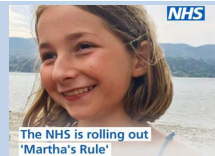
The NHS is rolling out 'Martha's Rule'

We are delighted to have been chosen by NHS England (NHSE) as one of the 143 NHS Trusts in England for a pilot scheme following the introduction of 'Martha's Rule'.