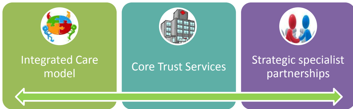
Figure 3: Proposed model of service configuration