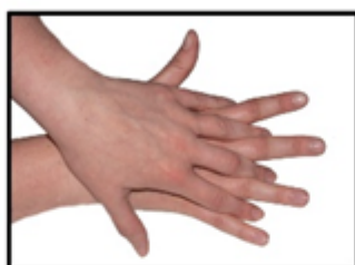
Back of each hand.