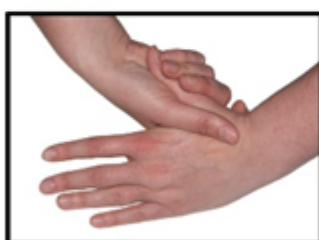
Rotational rubbing of thumbs clasped in opposing palms.