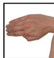
Rub both wrists rotating motion. Ensure hands are completely dry before moving on to the next step.

Developed by WWL Medical Illustrations Department.