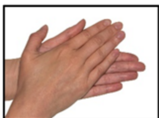
Palm to palm.