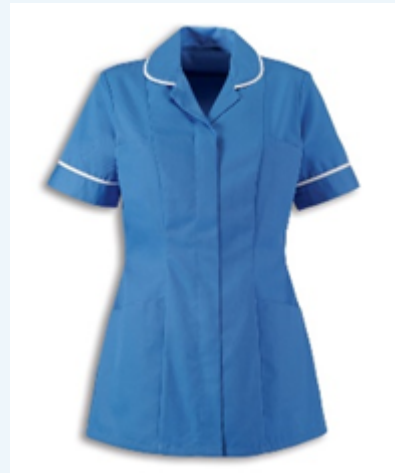
Health Care Assistant