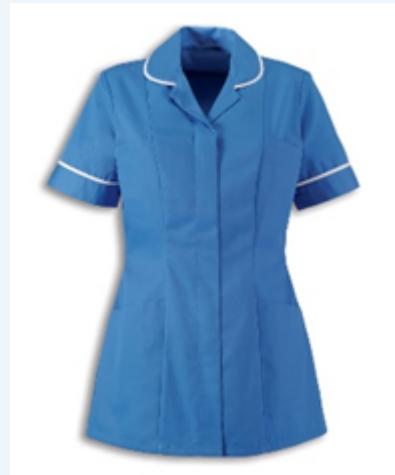
Health Care Assistant