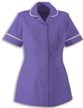
Head of Nursing