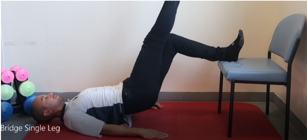
Bridge Single Leg