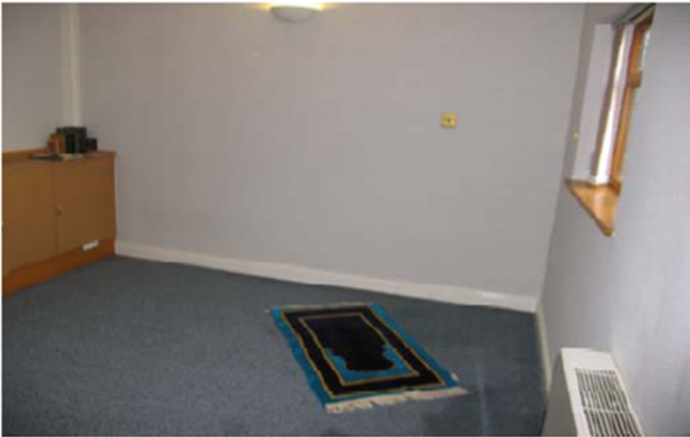
Multi-Faith Prayer Room.