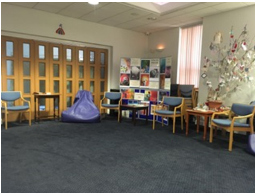
The Chapel at Wigan Royal Albert Edward Infirmary.