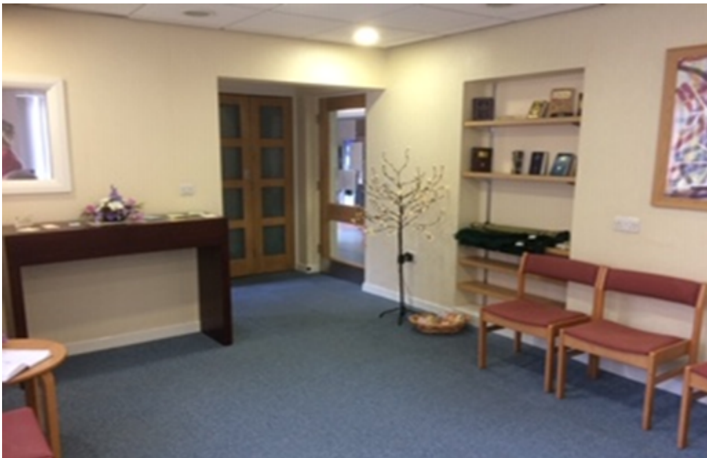
Multi-Faith Prayer Room at Wrightington Hospital